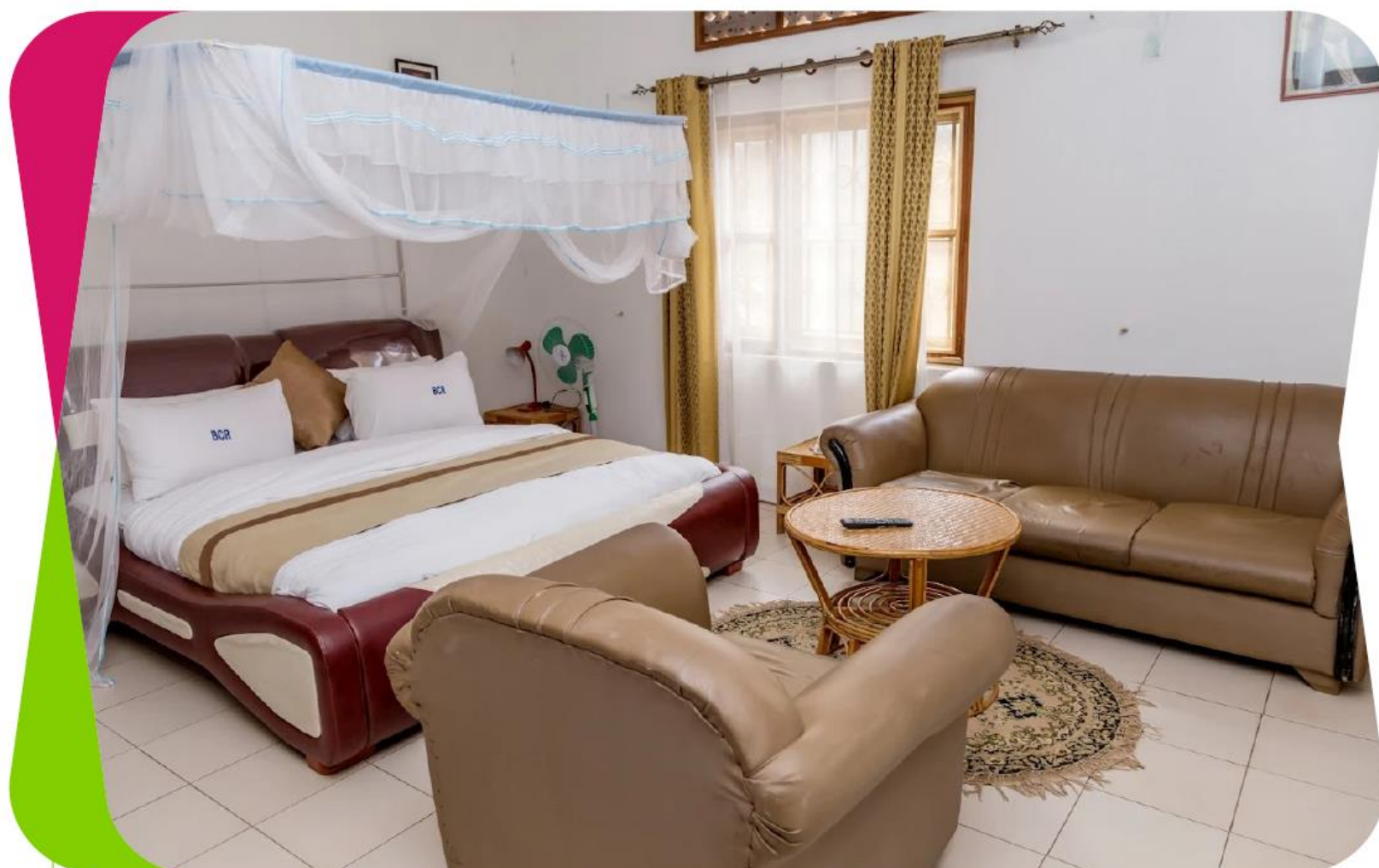
A luxury Buziga resort 7 km from Kampala, featuring accommodation, dining, a bar, a health club, and panoramic Lake Victoria views.